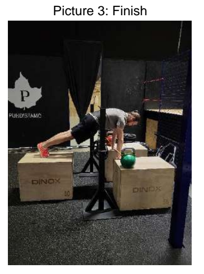
REP CRITERIA (Range of motion):

Starting position: Leaning on hands, elbows extended.